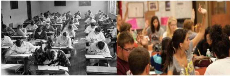
Other SAT Prep Classes