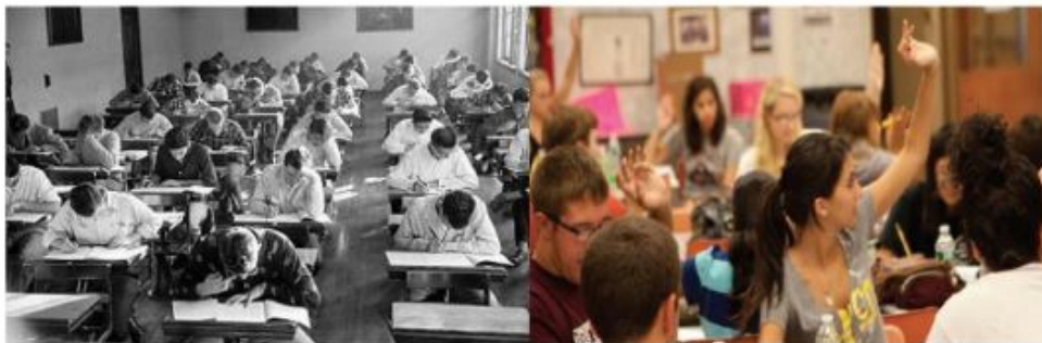
Other SAT Prep Classes