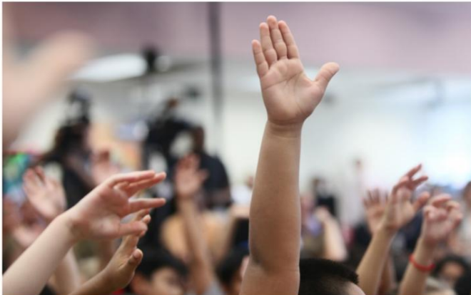
PTSA NOMINATING COMMITTEE – PLEASE CONSIDER NOMINATING SOMEONE OR YOURSELF...