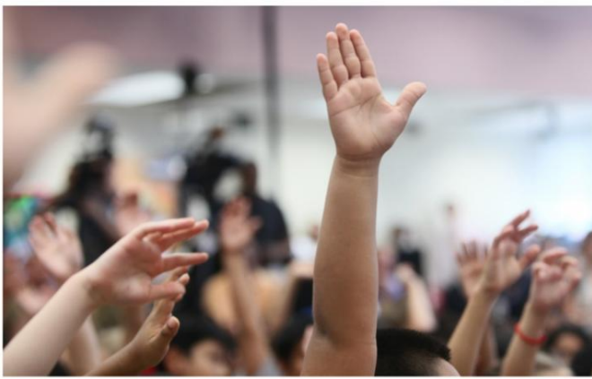
PTSA NOMINATING COMMITTEE – PLEASE CONSIDER NOMINATING SOMEONE OR YOURSELF...

for more than two years. The offices that the Nominating Committee fills are: President, VP of Membership, VP of Communications, Secretary, Treasurer, and Auditor.